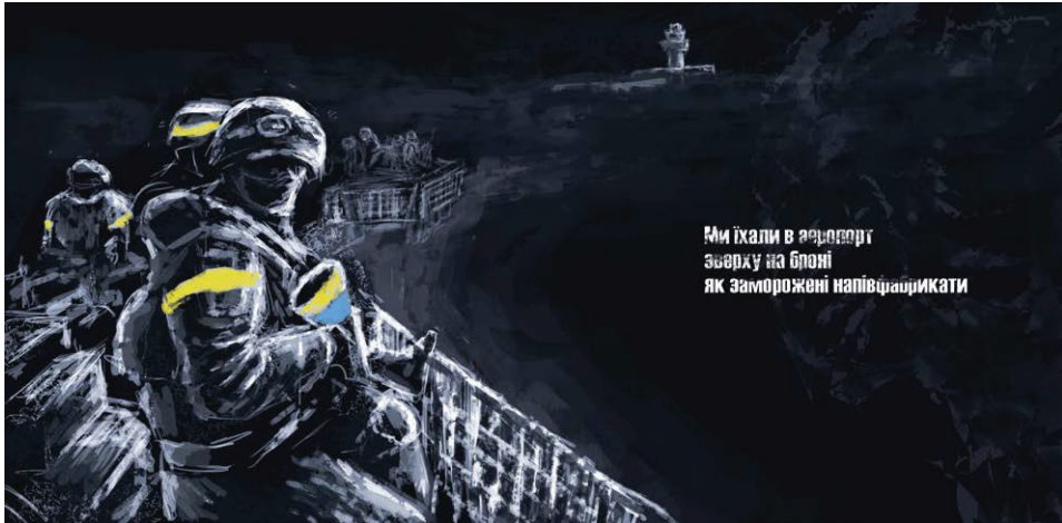
Illustration 1. Sketch search for composition to the words: “We drove to the airport on top of the armor, like frozen semi-finished products”

For emphasizing the emotional state of the fighters, the student used AR (augmented reality) technologies, which can supplement the perception of the real world, providing greater informativeness and interactivity.